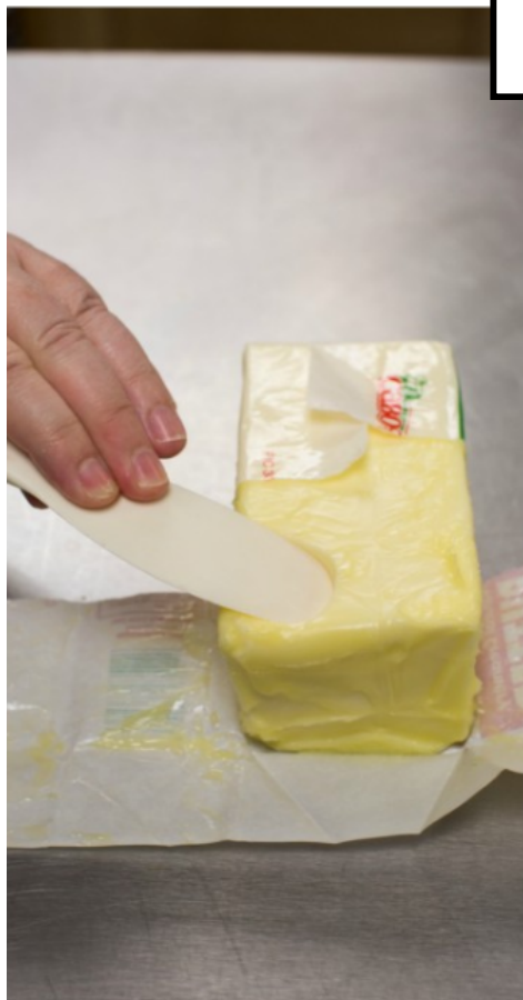
Ideal room temperature butter